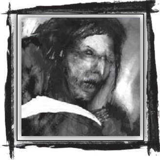
UTLUNTA, THE SPEARFINGER